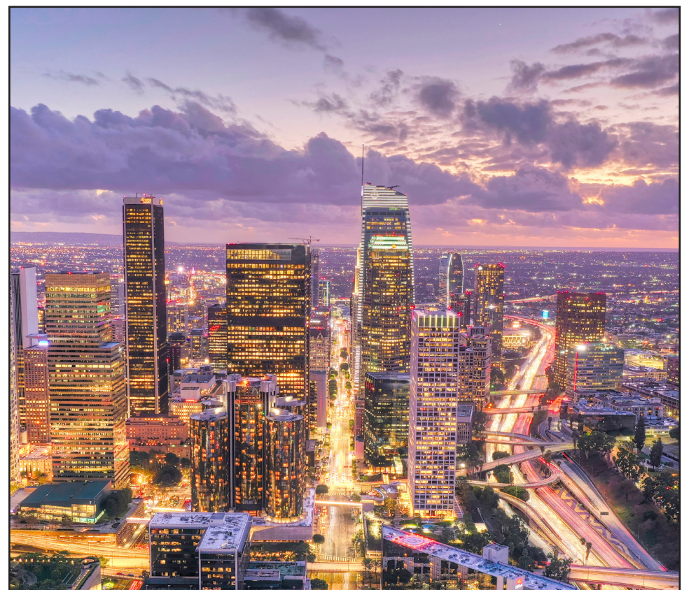
Los Angeles is the largest city in the state and the 2nd largest in the US

https://mayor.lacity.gov/news/mayor-karen-bass-releases-her-first-proposed-city-budget